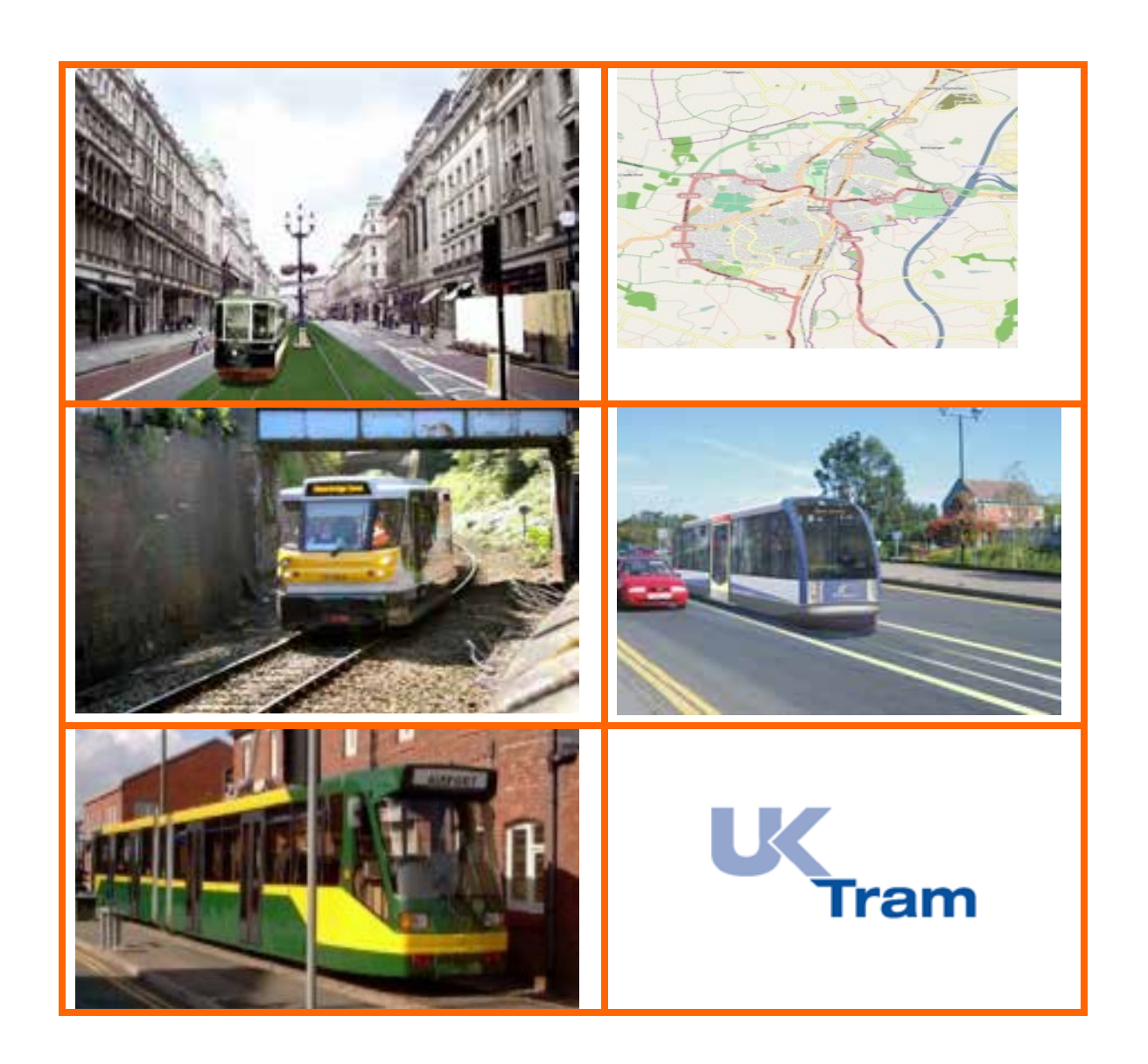
Advice Note for promoters considering ultra light rail